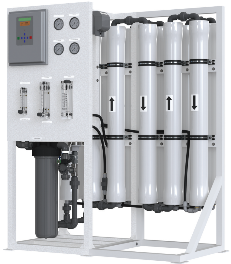
HRO 6 Reverse Osmosis System